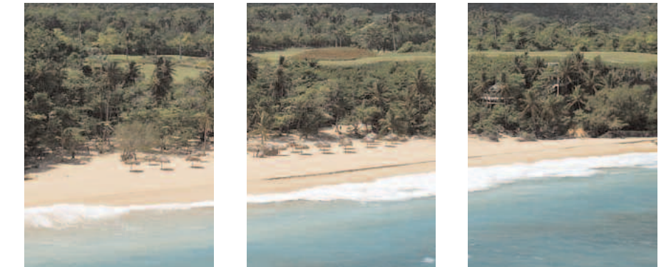
PLAYA GRANDE CLUB & PRESERVE